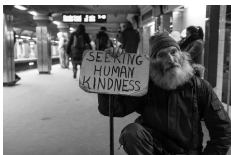
Image Description: B/W photo of a homeless man with a long, untrimmed gray beard, wearing a knit hat and a parka, holding a sign that reads, “Seeking human kindness” as he squats on a subway platform.