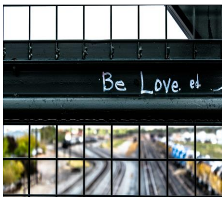
Image Description: Photo of a bridge painted black above a highway. On the railing in white letters: Be Love ed.

On Wednesday, January 29, I testified before the House Health and Human Development Committee regarding HB 140—the Ron Silverio/Heather Block End-of-Life Options Act. This legislation has been more than 10 years in the making. Last year it finally came to the governor’s desk, only to be vetoed. In my previous testimony I had told my story of ministering to a family who would have been spared terrible trauma if this legislation had been available to them. This time I chose another approach.