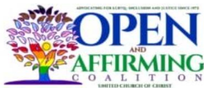
Image Description: Logo for the Open and Affirming Coalition of the United Church of Christ, comprised of a tree with a rainbow hand as the trunk and branches and leaves colored in rainbow hues, pink and blue, brown and black, and Open in blue letters, Affirming in green letters.