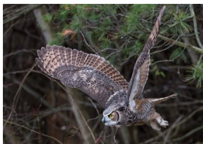
Image Description: Photo of a great horned owl in flight. In the background are pine trees, some with bare branches.

Remember remember the dead also those still with us that draw breath Remember veterans and armistice reasoning for war the wreckage of a man’s and a woman’s everyone’s living, family, a nation, a world, that it never ends anything but life