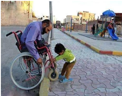
Image Description: Photo of a small child helping to pull a person in a wheelchair over a curb onto a sidewalk.

Earlier in June, the governor of Louisiana signed a bill that will require the Ten Commandments to be displayed in every public school classroom, including state-funded universities. Many pastors and other Christians I follow on Twitter commented that one never hears about evangelical or conservative Christians requiring the Beatitudes to be displayed. Some of the comments come *this* close to sounding like the Beatitudes are somehow better or require more from us than the Ten Commandments do. When the truth is, we as human beings have difficulty adhering to either set of religious morals. And neither one belongs in a public school classroom.