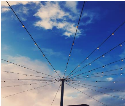
Image Description: Photo of pole with many strings of lights attached to it, like spokes on a wheel, against a deep blue sky with wispy white clouds.

I am looking forward to serving with you during Pastor Cynthia’s sabbatical. Su and I are “transplanted” Delawareans, having lived here for only seven years. When I first received standing in the Central Atlantic Conference, we lived in Germantown (Montgomery Cnty.) MD. We lived there until we moved to our new home in Smyrna in January 2016. We chose to move here because in 2013 I was called to serve the People’s Church of Dover as interim pastor. Due to the long distance between Dover and our home, we rented an apartment just two blocks from the church. We fell in love with