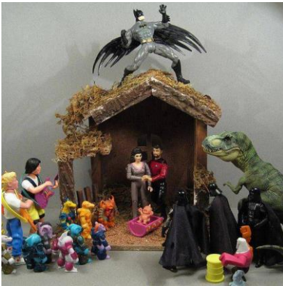
Image Description: Photo of a nativity scene with toy figurines: Deanna Troi as Mary, Cmdr. Riker as Joseph, 3 Darth Vaders as the wise men, Batman on the roof as an angel, T-Rex figurine, and assorted other characters.

The theme of Advent 2023 is “Children,” especially that they are individuals in their own right—not as an extension of their parents or society, but with their own hopes, fears, dreams, and needs. Who knew that more than Joseph and Mary?