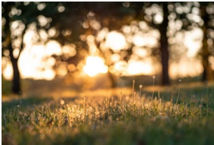
Image Description: Photo of the sun low and golden in the sky, shining through a small grove of trees onto a patch of dandelions gone to seed. Background is blurred and out of focus, foreground is clear and crisp.

Incredible as it is, I have been your pastor for ten years now. The difference between the first five years and the second five years has been like night and day. So are my plans for spiritual restoration. Where my first sabbatical was about pilgrimage to places, now I find myself wanting to make a pilgrimage to people. People who helped me become the person I am today.