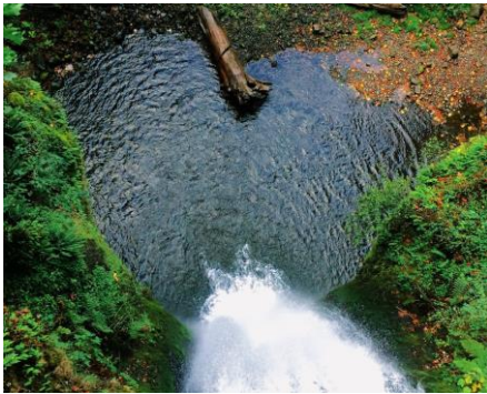
Image Description: Photo of a waterfall and pool of water from above. A log lies on the ground at the top middle edge of the pool so that it appears to take the shape of a heart. The pool is surrounded by lush green growth, dark rocky beach, and a red earth rocky beach.

Sunday, September 10, is Rally Sunday, the traditional day when we begin the church year anew. In many churches it is when Sunday School for all ages begins another year. After summer holidays and the last hurrah of Labor Day weekend, people return to a regular schedule of work, school, and volunteering, and the Church does the same.